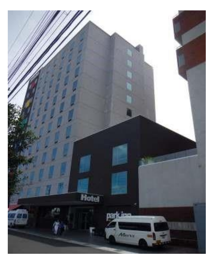
Hotel Park Inn in San Jose

Accommodation: All players and officials stayed at Park Inn and Crown Plaza in San Jose which is 10 minutes drive to the venue and it was excellent. The hotel is fully accessible for wheelchair players.